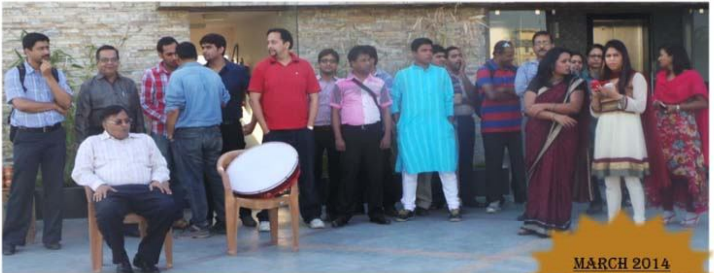
MARCH 2014 HOLI CELEBRATION

Events calendar for the year 2014 opened its doors to the colorful celebration of HOLI followed by gamut of events month after month. Here are the few of those events that marked as a high note to the events calendar of 2014